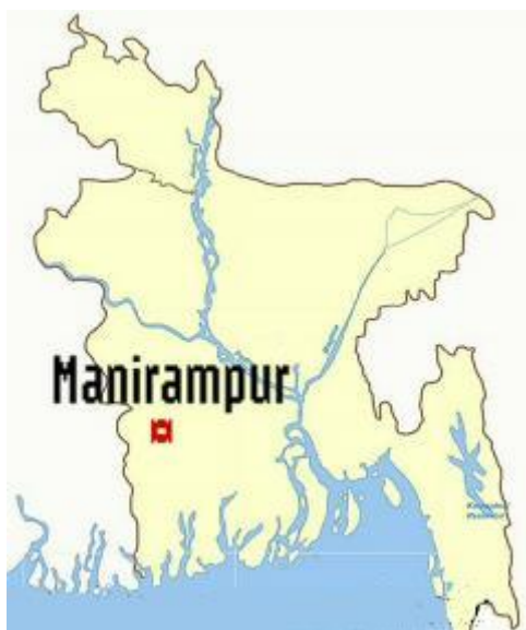
MAP OF THE AREA

PROTISHRUTI-JESSORE is an NGO which is exclusively dedicated to socio-economic advancement of the outcaste people. It conducted surveys on outcaste or religio-ethnic minority groups and since its establishing, it has been making developmental interventions exclusively for outcaste or religio-ethnic minority groups.