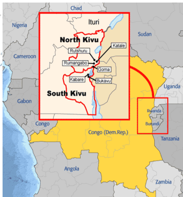
MAP OF THE AREA/ NORTH KIVU